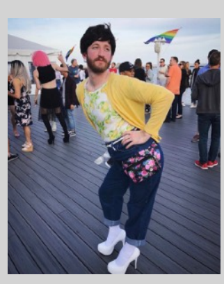
Follow for Follow